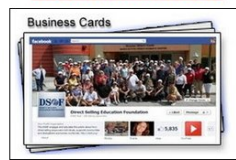
FACEBOOK EXAMPLE #1