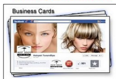
FACEBOOK EXAMPLE #2