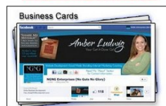
FACEBOOK EXAMPLE #3